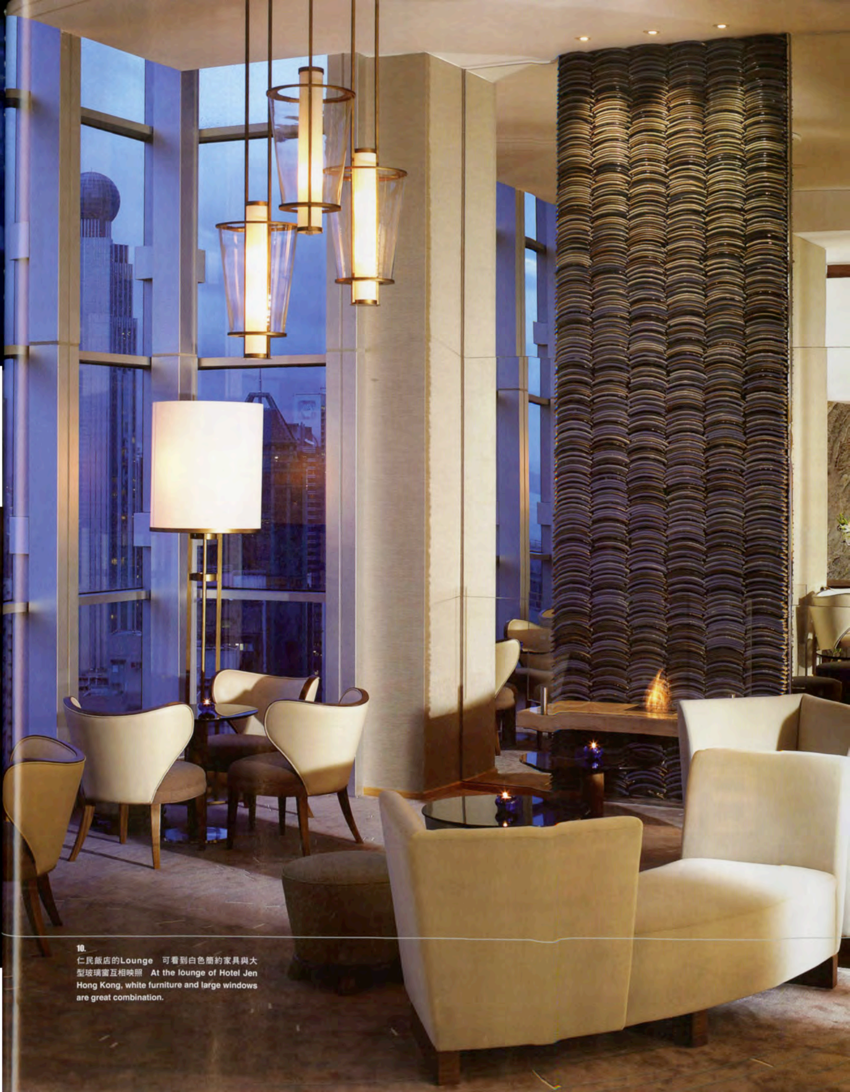
10. 仁民飯店的Lounge 可看到白色簡約家具與大型玻璃窗互相映照 At the lounge of Hotel Jen Hong Kong, white furniture and large windows are great combination.