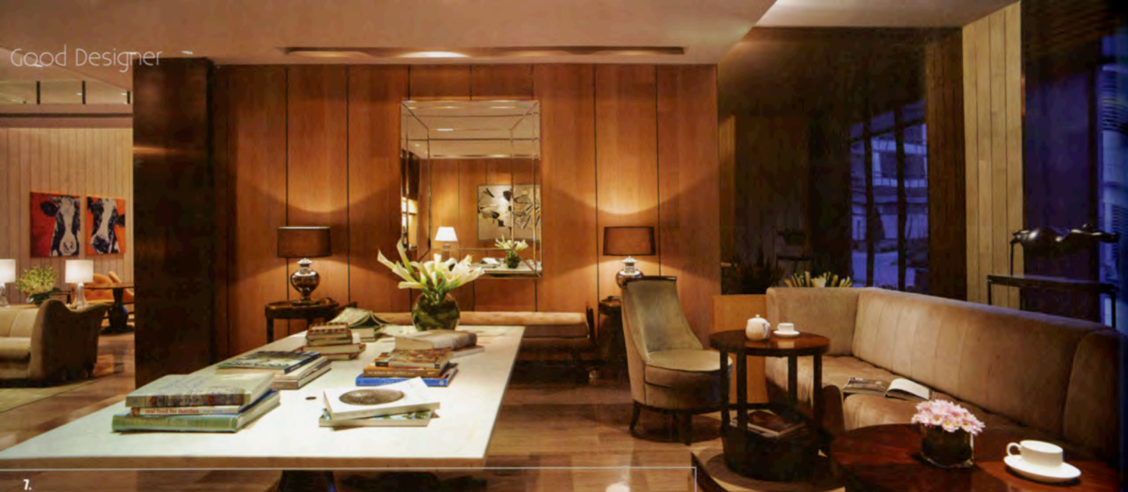
7. 北京逸園新城國際酒店公寓 則希望打造成都市的寧靜綠洲。 The concept behind Lanson Place is to nurture with nature.

至於榮登2009年度IDC酒店設計大獎最佳酒店等多項獎項的香港仁民飯店，則是為香格里拉集團構思的全新中價品牌。希望打造一所時尚商務酒店，體現中國美學中的和諧 簡約與實用風格。從鑲嵌在牆壁上的中式磚瓦、大堂入口處的鐵鑄蓮花等，皆展現充滿象徵意味的中式品味。由於餐廳以中式麵食為主，因此一幅以典型中國煤餅砌成、從背後投光的牆壁，效果出奇地時尚。