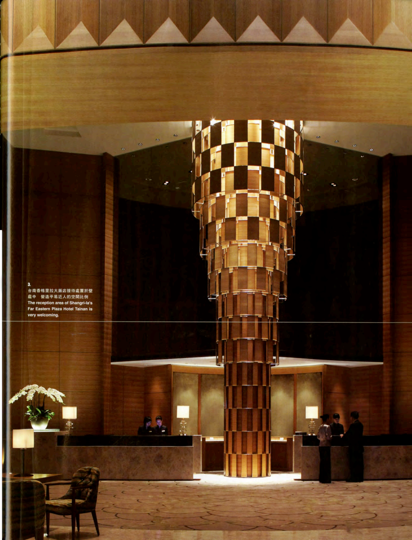
3. 台南香格里拉大飯店接待處置於壁龕中 營造平易近人的空間比例 The reception area of Shangri-la's Far Eastern Plaza Hotel Tainan is very welcoming.