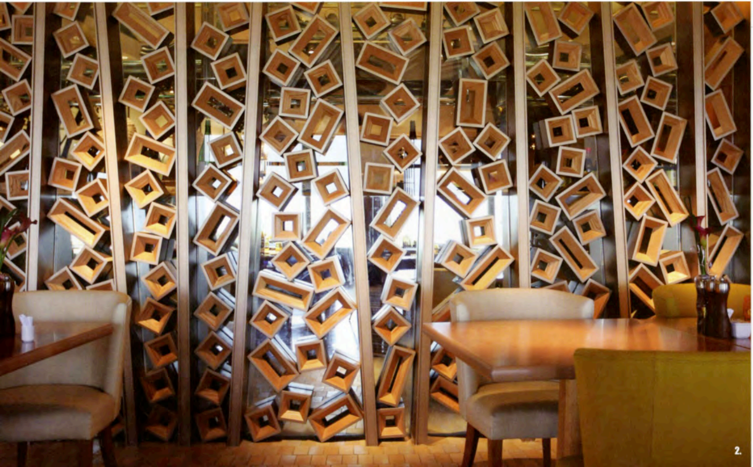
2. 以日式便當為設計理念的特製屏風 A shield inspired by the Japanese lunch box.