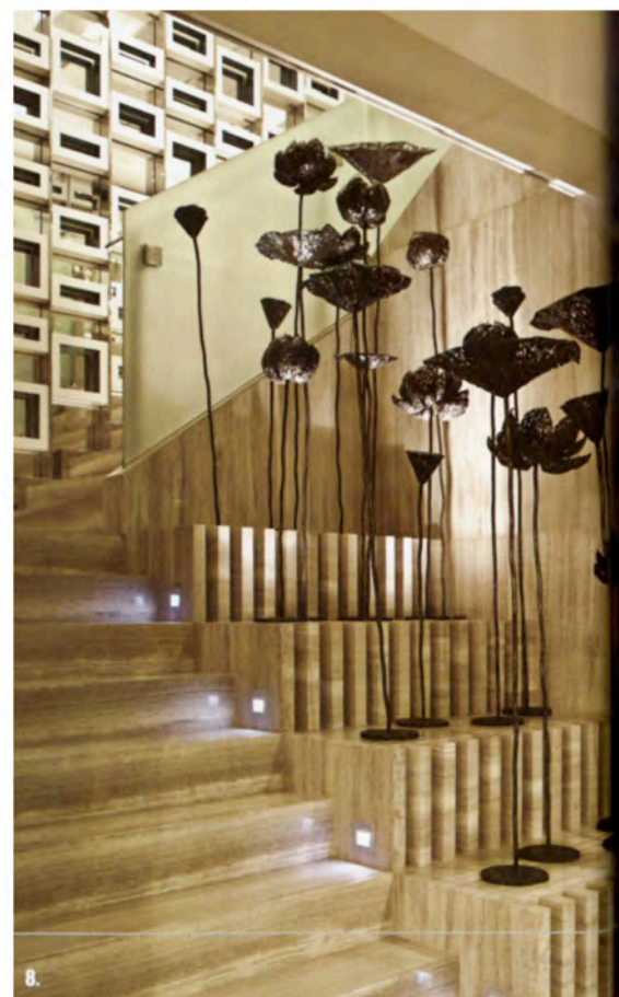
8. AB Concept再度運用擅長的大小不同框框組合妝點仁民飯店。 AB Concept uses various frames to decorate at Hotel Jen Hong Kong.

AB Concept's design manages to balance stimulation with a sense of deep tranquility, and through it they aim to anchor each project to a client on a physical and emotional level.