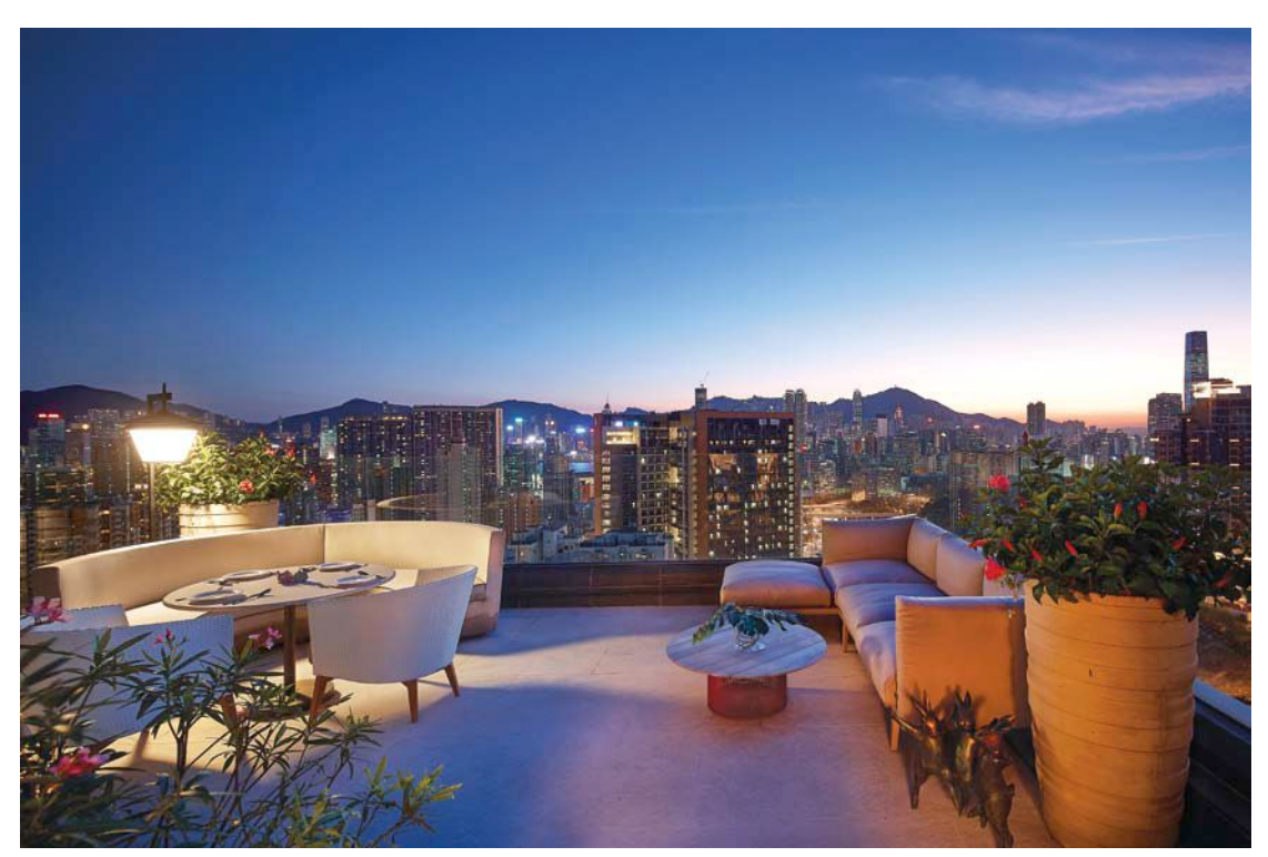
LUXURY HOUSE LIVING Hilltop House, one of the penthouse duplexes in the Grand Floor Collection, offers stunning views of the mountains and the harbour

ituated in a tranquil green-belt zone, Homantin Hillside is a new low-density complex on Wai Yin Path that comes with stunning views of the city and the harbour. Those looking for something extra special can choose from the 12 units in the Grand Floor Collection, which includes four penthouse duplexes. Each unit comes in a different configuration, with unobstructed panoramic views.